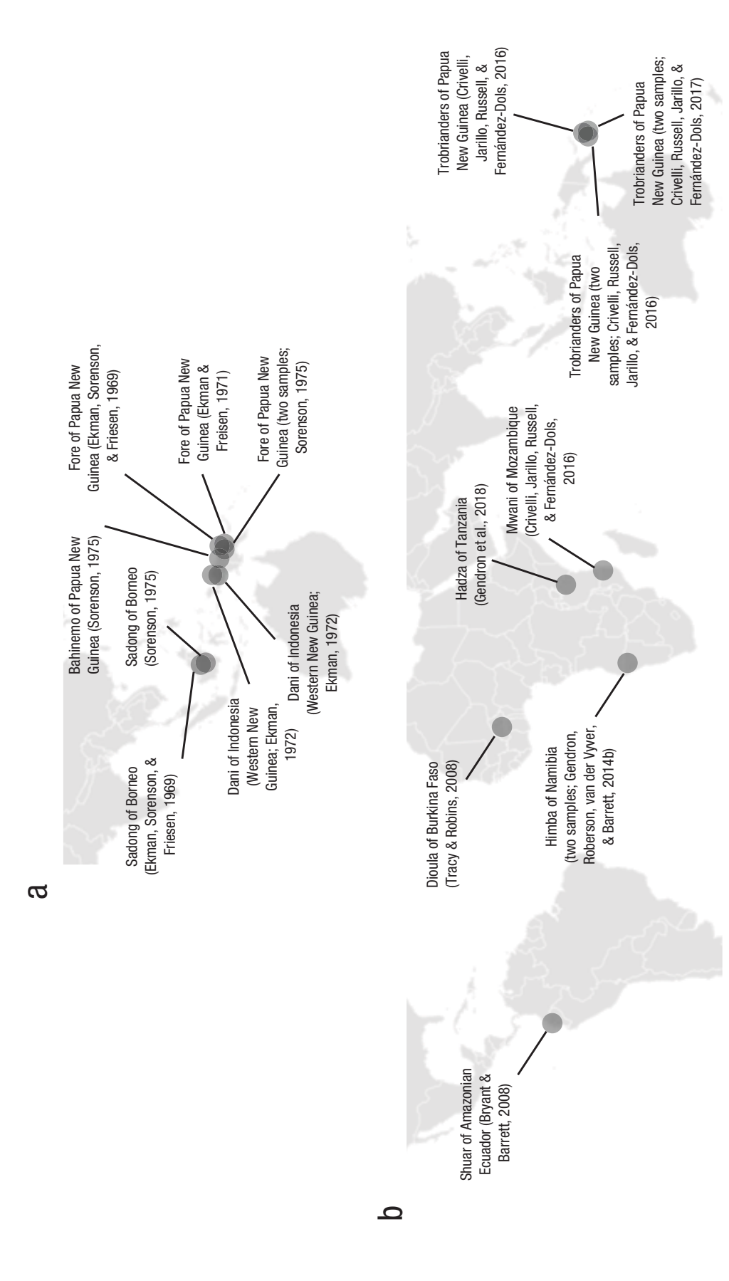
1969 and 1975 (Epoch 1) and (b) between 2008 and 2017 (Epoch 2). Small-scale societies typically have members numbering in the hundreds or low thousands and often ies conducted in Epoch 2 spanned a broader geographic range, including Africa and South America, resulting in increased diversity in the ecological and social contexts of the societies tested. This type of diversity is a necessary condition for discovering the extent of cultural variation in psychological phenomena (Medin, Ojalehto, Marin, & Fig. 1. Maps showing the locations of studies that tested the universality thesis for facial movements in small-scale societies, separately for studies conducted (a) between maintain autonomy in social, political, and economic spheres. The studies conducted in Epoch 1 were geographically constrained to societies in the Pacific area. The studies